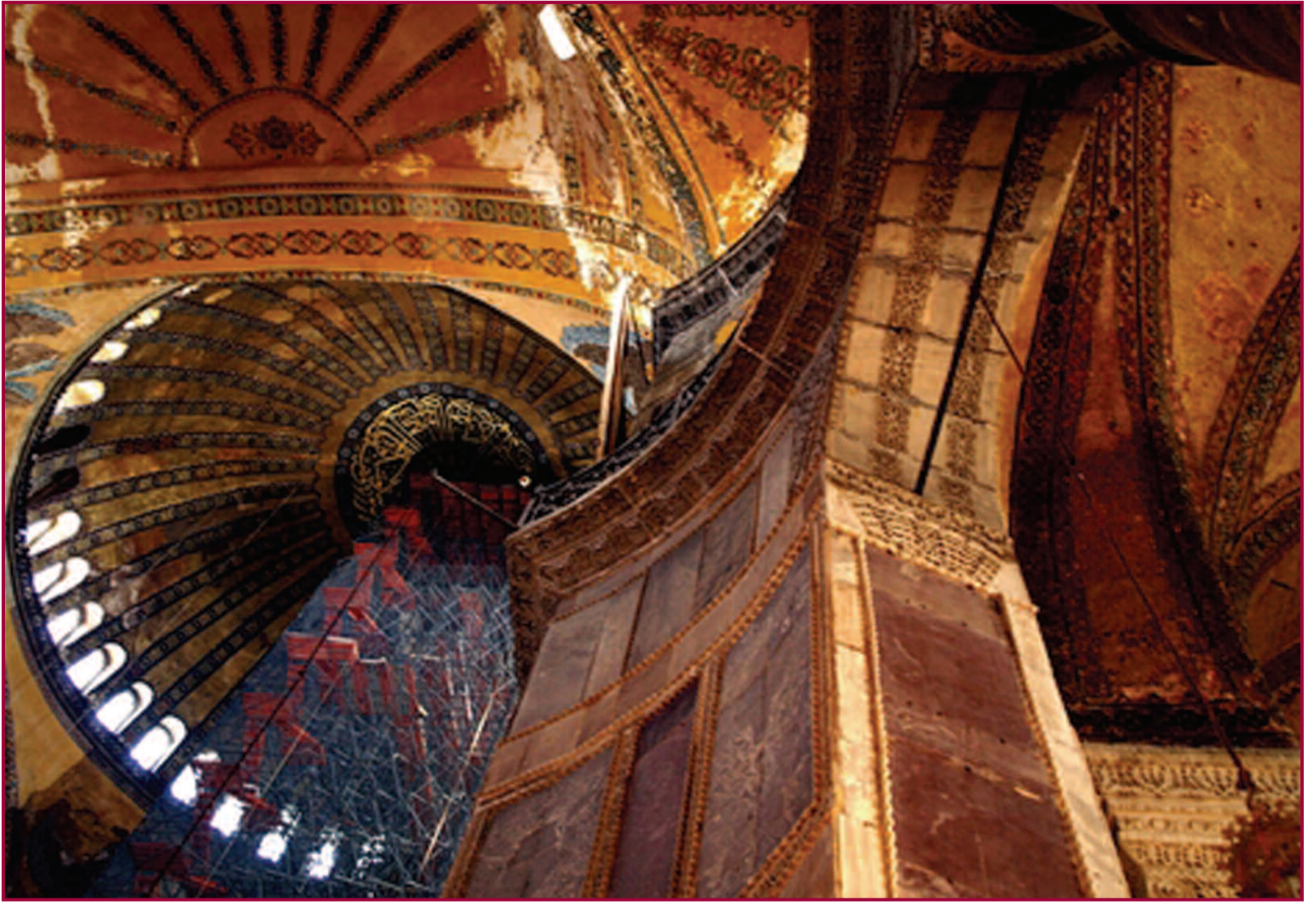
Hagia Sophia Ceiling Brown

(Jumma'ah Salah at 1.00 pm / UNTIL LAST FRIDAY, OF THIS MONTH)