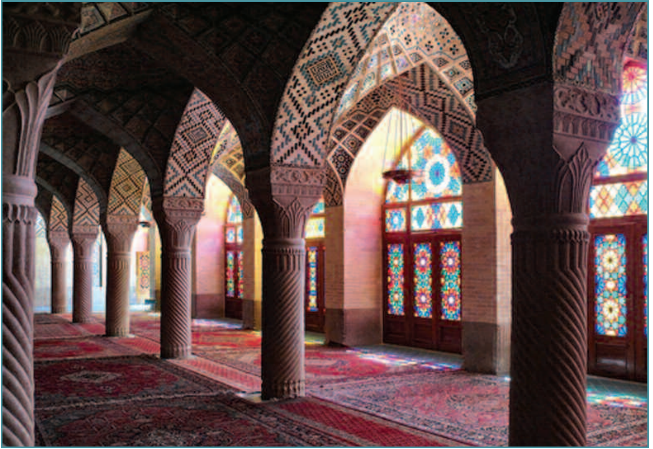
Multicoloured Muslim Masjid Room