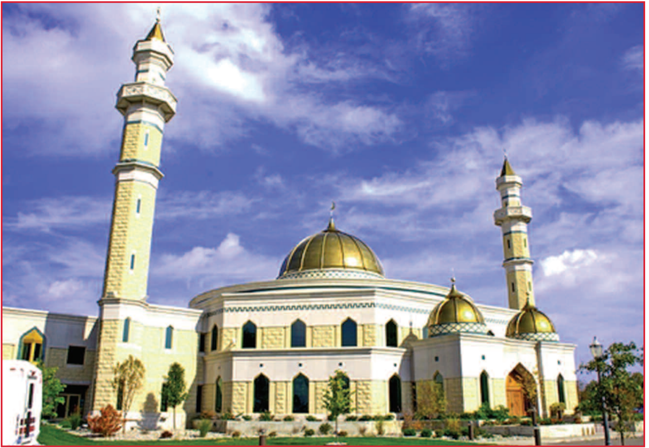
Dearborn Masjid - Michigan