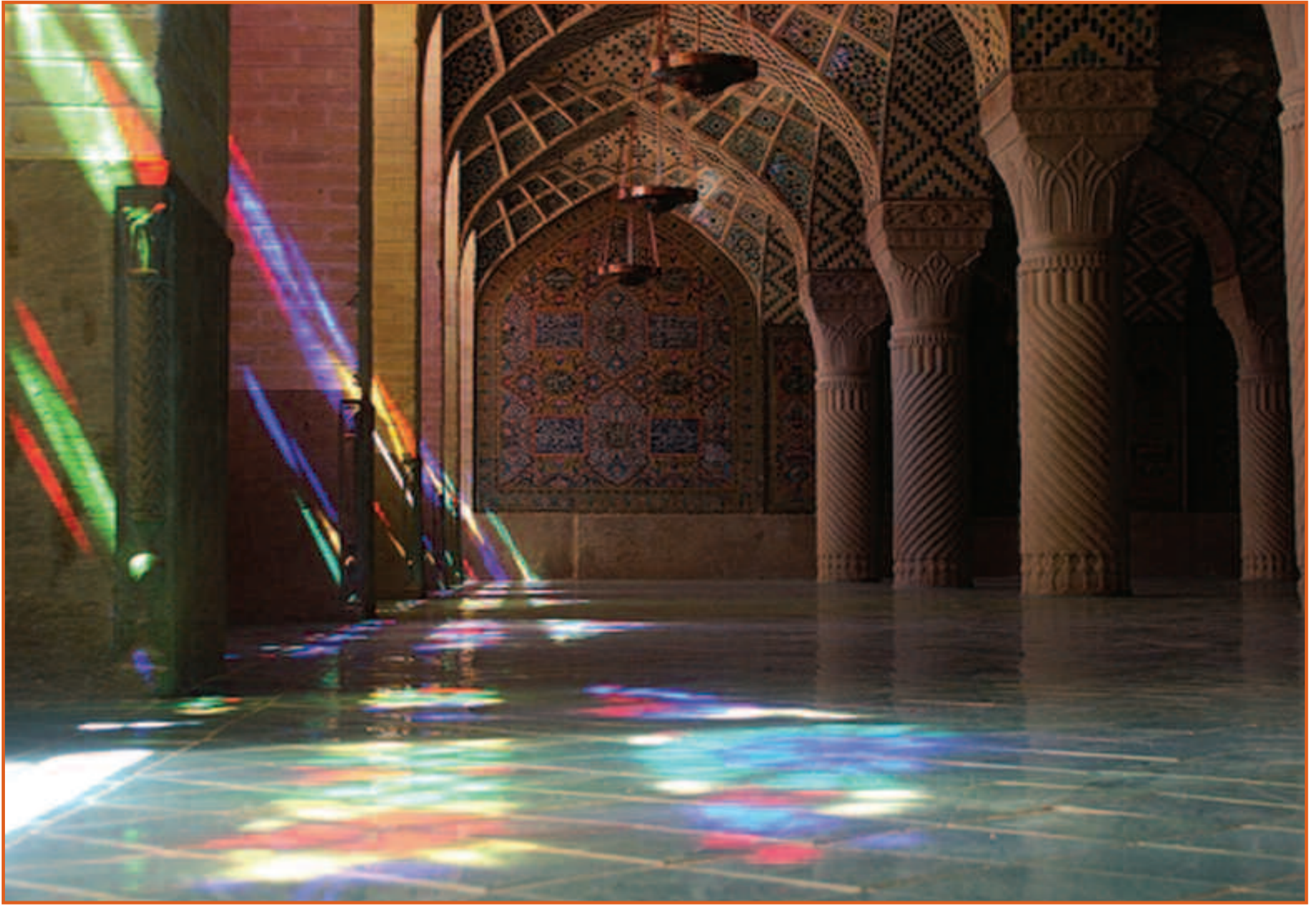
Iran - Persian Masjid Pillars