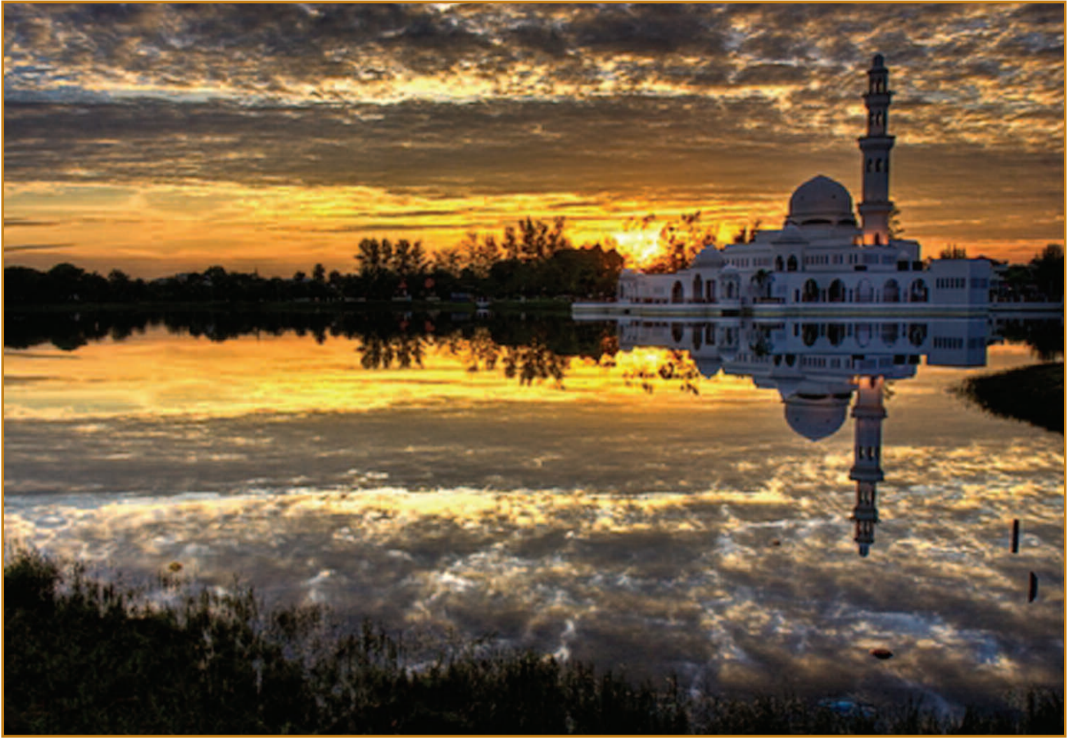
Masjid - Terapung