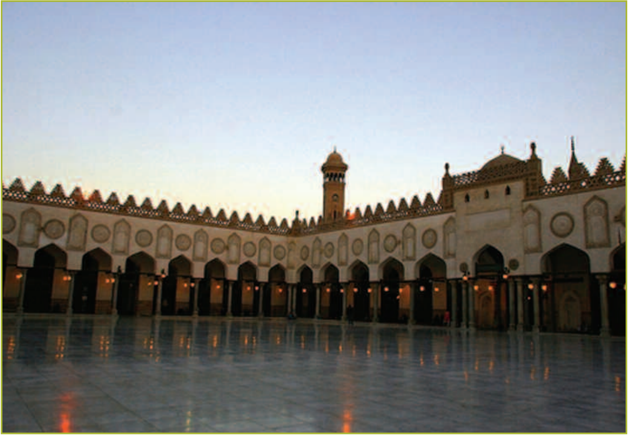
Al-Azhar Misjid - Cairo, Egypt