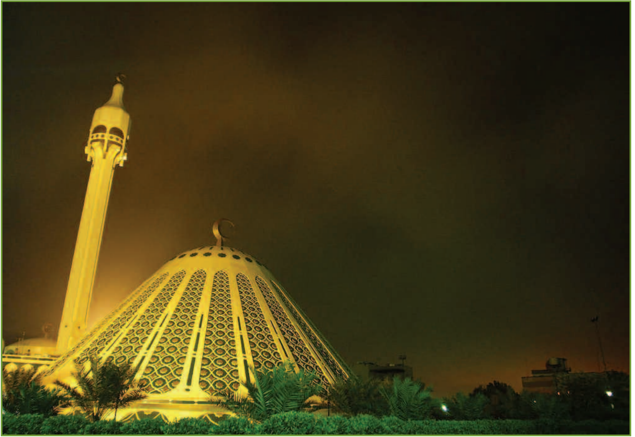
Xcitefun Fatma Masjid - In Kuwait