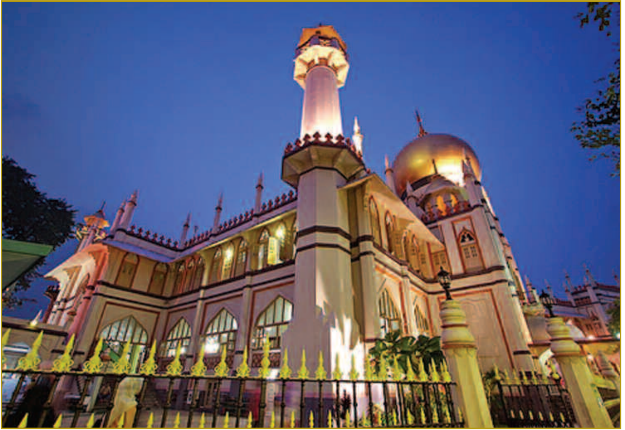
Sultan Masjid - Singapore